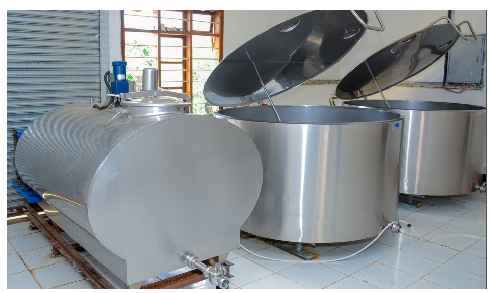
Milk storage tanks at Busokela main collection centre.

the team also visited some of the individual beneficiaries who produce the milk, one of them, Omega Oberth who own four cows, one from South Africa, says that he benefits a lot with milk with